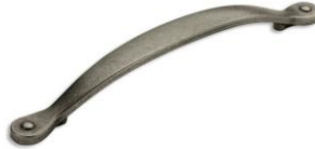
Image is not to full scale. Actual pull is larger than this photograph.